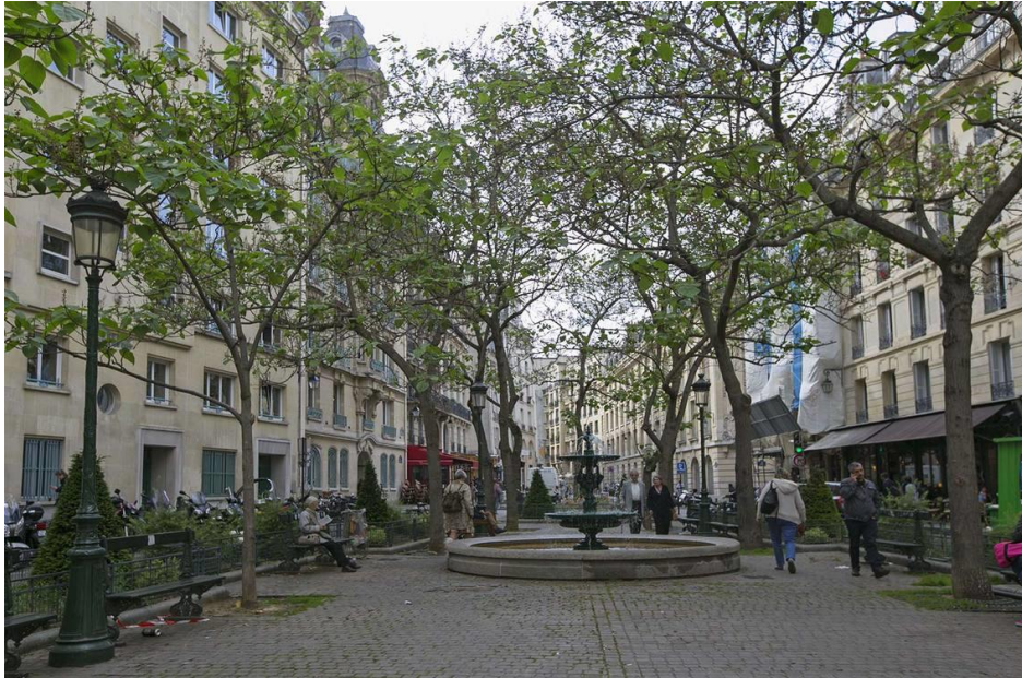
Place de l'Estrapade

You may then walk down “rue de l'Estrapade” then “rue Blainville” until “Place de la Contrescarpe”. You may walk down “rue Mouffetard”, then turn left on “rue Ortolan”, then right on “rue Gracieuse”, “rue Lacepede” on the left again, then “rue Cardinal Lemoine” on the right (from place de la Contrescarpe) until you get to the Seine river.